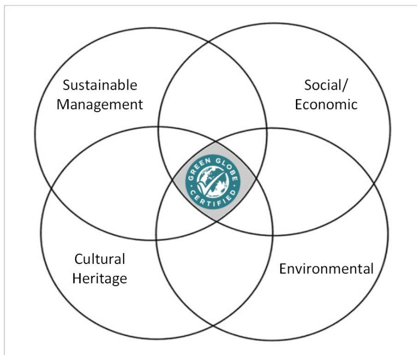
FIGURE 1: THE GREEN GLOBE STANDARD CRITERIA & INDICATORS

These four sets of indicators for each of these sustainability criteria are summarized in Chart 1.